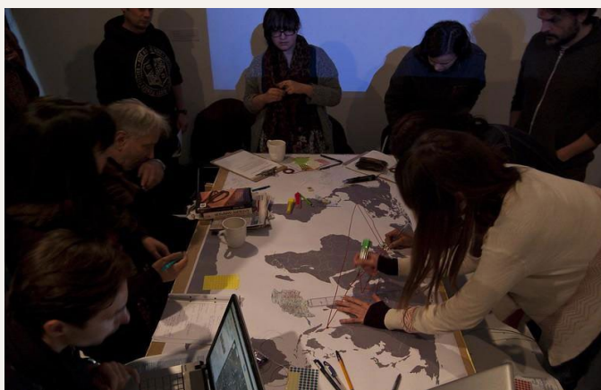
Movable Borders: The Reposition Matrix at Furtherfield Gallery in 2013

The workshop was useful to materialise the previously hidden and confusing information about where drones are being made and distributed, legally and clandestinely. I was present at the workshop that day. There was a steady rhythm with those who just sat around and watched what was happening, even making tea and sharing food while the participants mapped drones and their materials worldwide. A diverse mix of visitors and participants attended, including artists, academics, social scientists, and passers-by in the park. The combination of citizen-based and academic research brought a closer understanding of the subjects at hand through learning, discussing and collaborating. Thus creating the circumstance where cultural peer-enhanced emancipation took place.