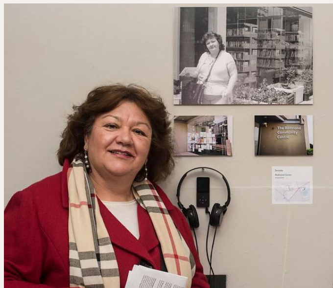
Superdiversity — Picturing Finsbury Park. 18 - 26 February 2017.