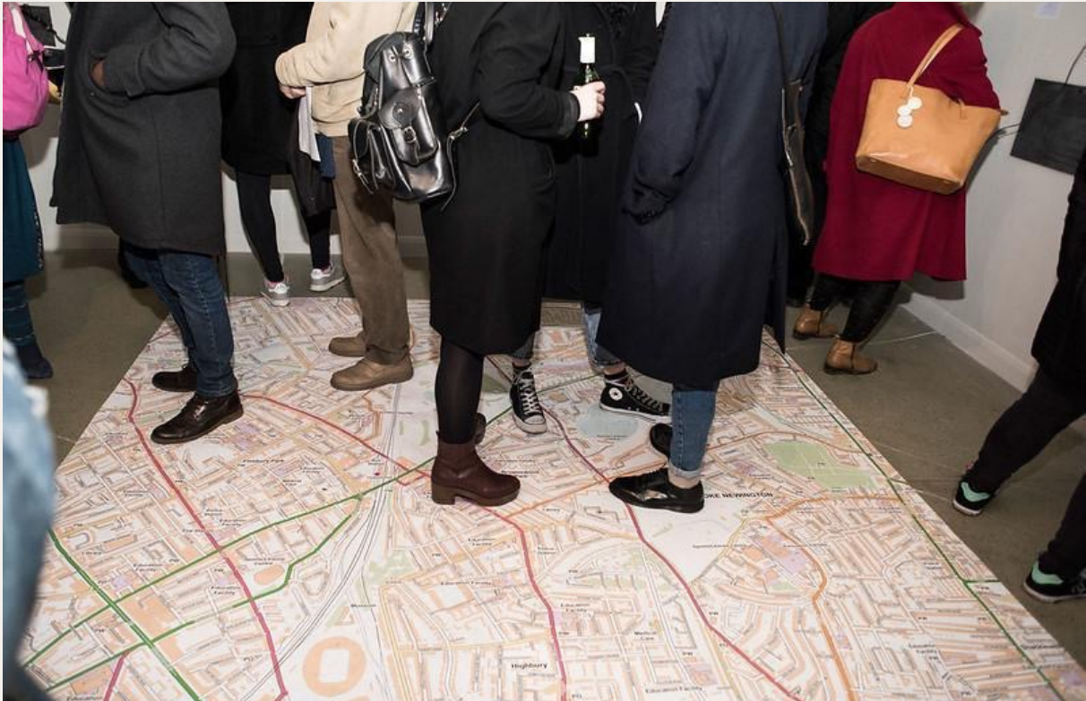
Superdiversity - Picturing Finsbury Park. 18 - 26 February 2017.

Furtherfield has worked with the public in the park for a while. The examples I'm presenting in this essay are just a small representation of a rich, complex and joyful set of experiences we have been lucky to be involved with. Looking back at them, another thread linking them all up is agency. Through conversations with the public who have visited the gallery, we have been informed of what is of public interest. Gentrification haunts people trying to survive in the area, the same as in other parts of London. The worst examples of gentrification prioritise the economic interests of distant property developers (often in league with cash-strapped and ideologically ambiguous Local Authorities) with scant regard for existing residents. 22