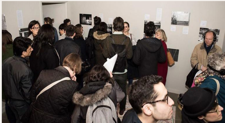
Superdiversity - Picturing Finsbury Park. 18-26 February 2017.

Stansfeld and Furtherfield wanted to know more about the people who lived in the local area of Finsbury, Haringey, Islington and Hackney, all neighbouring the park. For us, it was a way to connect to more people in the area to talk about each other's lives and histories. For Stansfeld, it was a chance to explore local people's lives to see what the area meant for different people. Asking what place and difference meant for them in the context of a neighbourhood in today's London, a global city, it also attempted