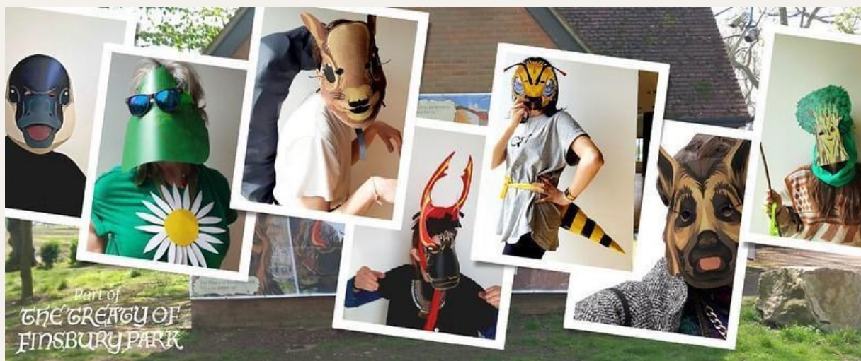
The Interspecies Festival of Finsbury Park 2023.

Treating the location of our gallery in Finsbury Park, London, as a microcosm of the whole imperilled Earth, we co-devised a five year series of exploratory LARPs (live-action role play) events. LARP is a game of collective make-believe where people adopt new characters and interact with each other in a fictional setting. There are no lines to recite, only improvisation in response to fictitious events. 50 Furtherfield hoped to use the power of play with park communities to rediscover and renew their relationship with nature. This constellation of LARPs, which went under the heading of The Treaty of Finsbury Park 2025 , sought to stimulate action socially and ecologically sustainable futures – for instance, by scaffolding people’s imaginations, providing equitable spaces for exploration, and building new networks and capacities. 51 In doing this, we sought to catalyse the blooming of bountiful biodiversity from interspecies political action.