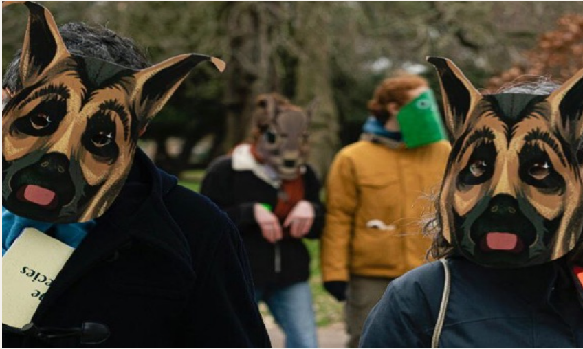
Snapshot from an Interspecies Assembly happening live in Finsbury Park.

As cities now hold some of the world's greatest biodiversity, we can't help but wonder if they also hold the greatest potential for positive impact. It's time to spark new ways of being, feeling and acting together locally, nationally, and internationally. 54 One of the advantages of having experiences that go beyond an exhibition in the singular is that it creates a deeper exhibition engagement. Plus, the contexts of the works, the artists, their values and the stories behind them are not lost. Strong research brings about a situation where all actors are closer together in recognising all the participants' skills, ideas and practices.