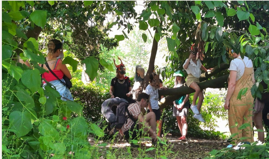
The Interspecies Festival hosted by Furtherfield took place on three scorching days in June 2023 in Finsbury Park, North London.

The Treaty of Finsbury Park 2025 is part of a larger project in collaboration with various international and UK-based organisations associated with creative approaches to transformation and sustainability. In the LARPs, players were matched with one of seven Mentor Species of the park. They were supported through