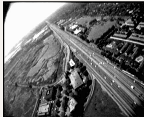
Bit Plane by Bureau of Inverse Technology. 1997.